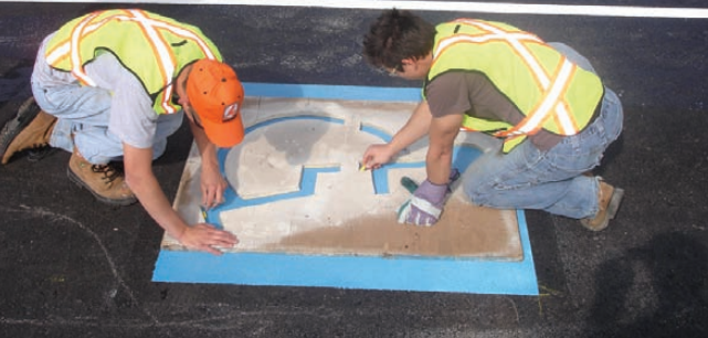
STEP 5: Installing complicated symbols