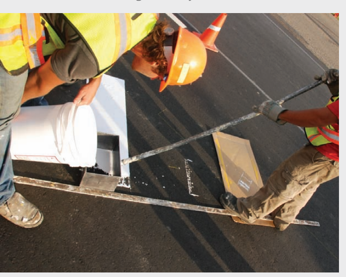
STEP 3: Stop-bar application