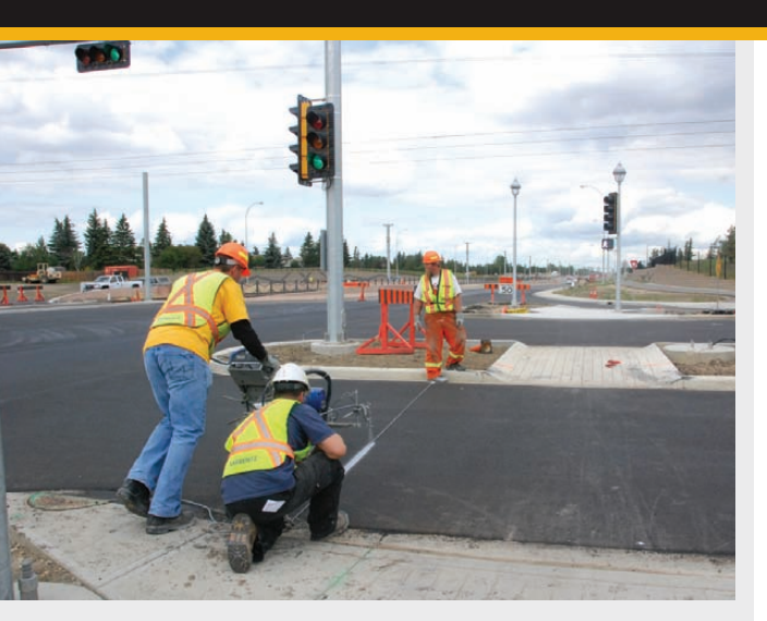
STEP 1: Pre-marking the lines