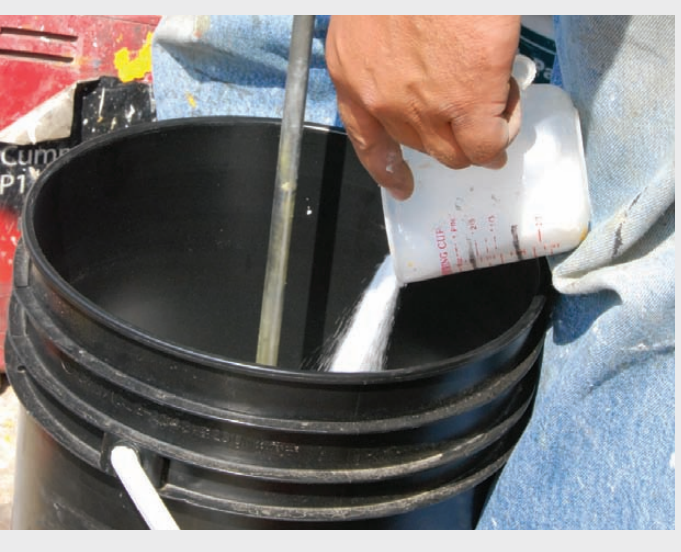
STEP 2: Adding the catalyst