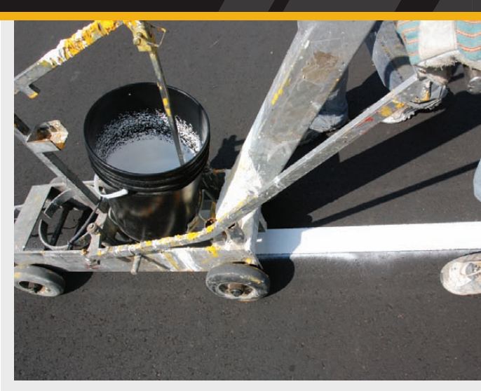
STEP 4: Longitudinal line application

It is good practice to keep tools and equipment in a clean state. While the material is soft, the tools and equipment can be cleaned with a scraper, rags and solvent. Acetone, Xylene or Toluene are types of solvent that work well. If the material hardens on tools and equipment, the material can be softened and released by heating with a propane tiger torch.