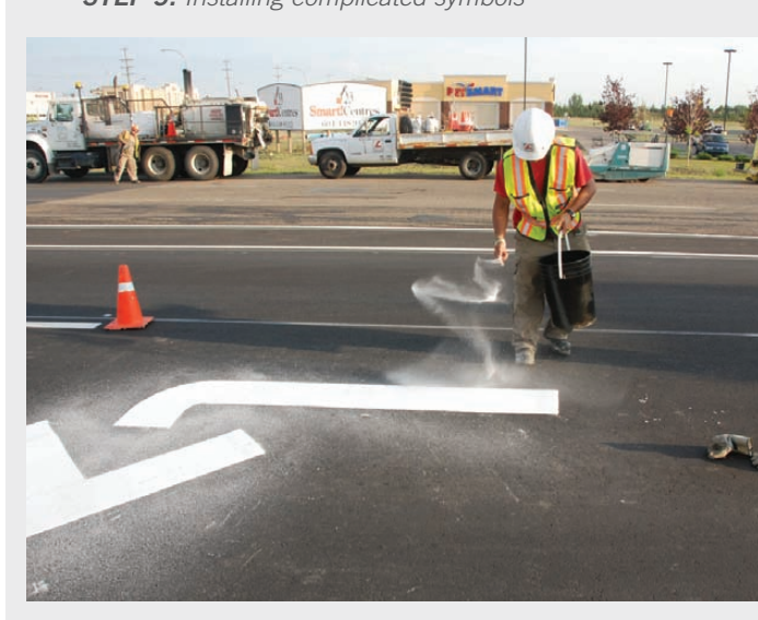
STEP 6: Glass bead application