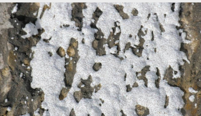
Close-up of Pathfinder, white